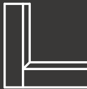
Timberweld® Joint Heritage Look